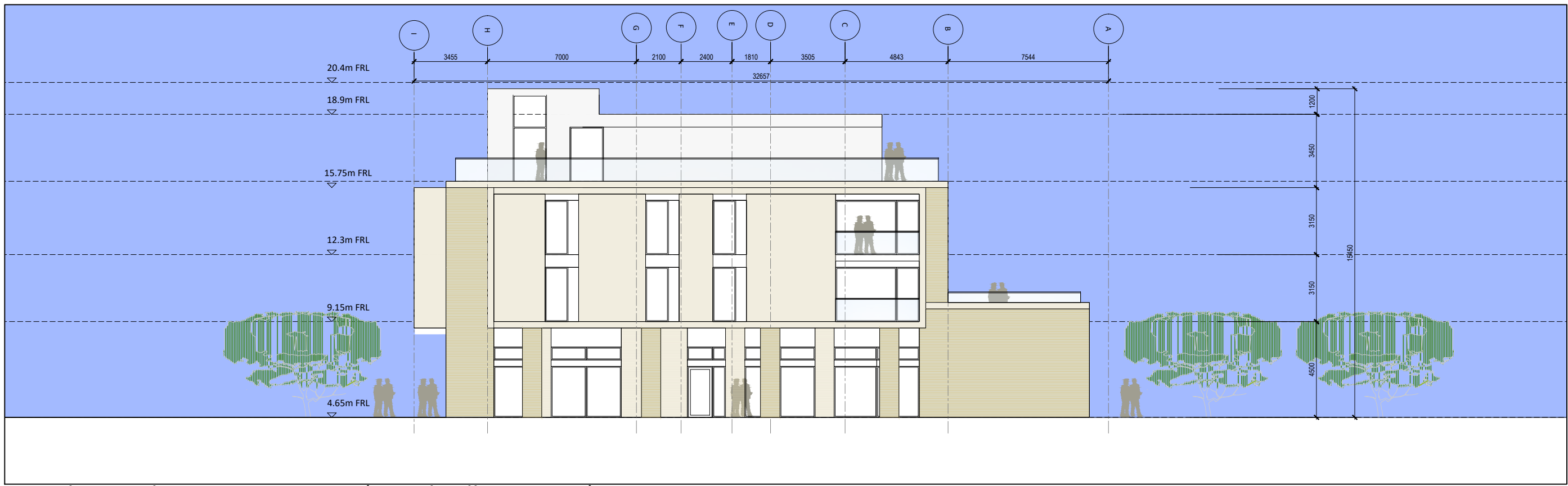
Block D North East Elevation to Marina (Boardwalk Frontage)